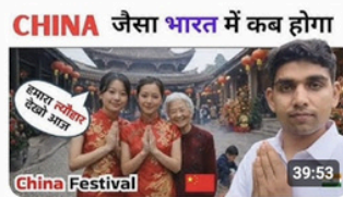
China का नया साल एकदम दीपावली जैसा Road trip Day 4 23K views • 6 days ago