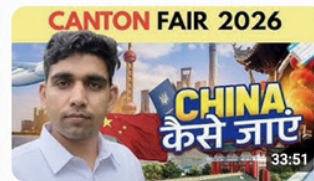
Canton fair 2026 कैसे आए, कहाँ रुके, कितना खर्चा आयेगा, Sim card a to z fu...