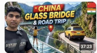
China Glass Bridge and Road Trip Day 2 54K views • 2 weeks ago