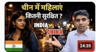
Women Safety in China vs India चीन कितना सुरक्षित है?