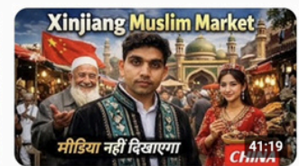
China का मुस्लिम बाजार Grand Bazaar Xinjiang China Niranjan 190K views • 1 month ago