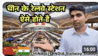
Railway station China vs Indian. Real China | Indian in China