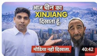
China का शिंजियांग दिखाता हूँ जो मीडिया नहीं दिखाता