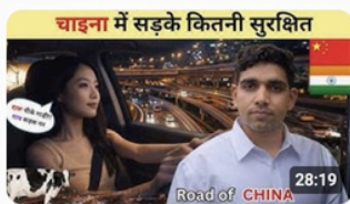
China roads चीन की सड़के कितनी सुरक्षित 44K views • 2 weeks ago