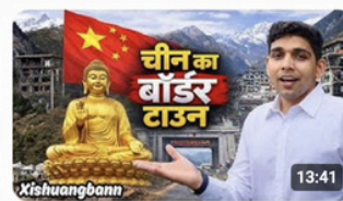
China का बोर्डर वाला कस्बा China border town Xishuangbanna 33K views • 3 weeks ago