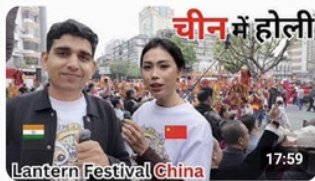
China में होली Lantern Festival China 30K views • 3 days ago