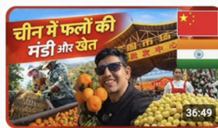
China Fruits Market and orange farming China Niranjan 86K views • 3 weeks ago