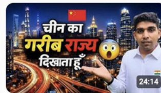
China का गरीब राज्य Road trip day 3 China poor state capital 106K views • 11 days ago